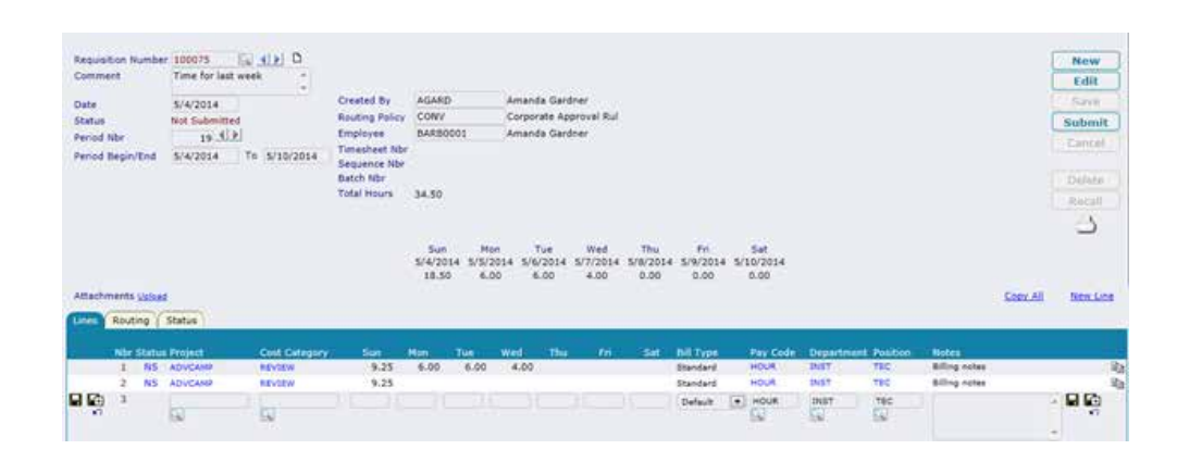
Figure 1. Timesheet

Whether tracking project time is crucial for billing, or cost analysis, the timesheet module enables you to do so within a fully integrated solution.