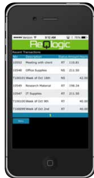
Figure 2. Transaction list